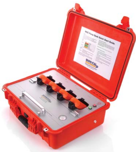
MGC Pump Dock

Size 5.7 x 3.0 x 1.5 in. (147 x 78 x 38.3 mm.) Weight 12.4 oz. (352g) Temperature -4° to +122°F (-20° to +50°C) Humidity 5% to 100% RH (non-condensing) Battery Life 5 days continuous Pellistor: 30 hours continuous Charge Time 4 - 6 hours Alarms Visual, Vibrating, Audible (minimum 95 dB) Low, High, STEL, TWA and OL (Over Limit), Pump LEDs 4 red alarm bar LEDs Yellow backlight (activated on button press) Red backlight (activated on alarm condition) Yellow Maintenance Notification LED Display Alphanumeric Liquid Crystal Display (LCD) Logs 25 Bump tests 25 Events 25 Calibrations Continuous 1 second data logging (> 2 month typical capacity) Tests Full function self-test upon activation Sensors, battery and circuitry conditions